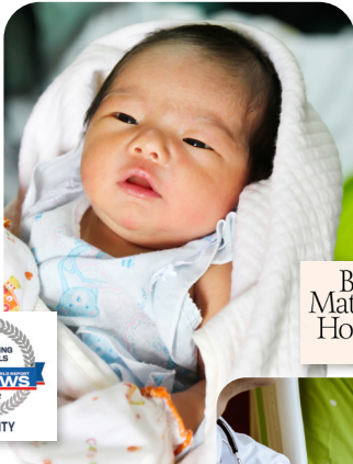
Award-Winning Maternity Care