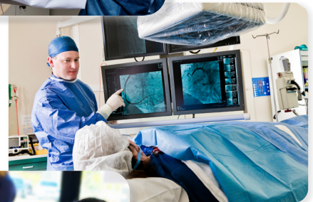
Minimally Invasive Cardiovascular Procedures