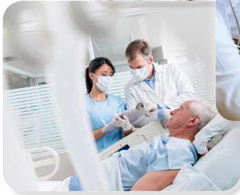
Comforting Hospice Care

Our expert emergency room physicians and staff cared for 31,763 patients.