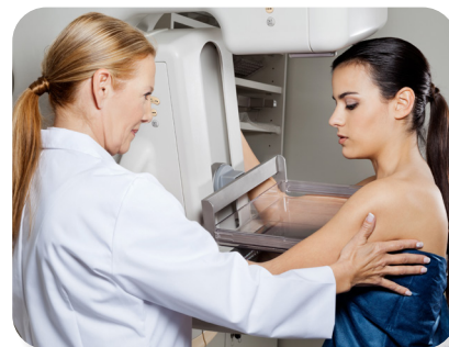
Breast Screenings With the Most Advanced Technology